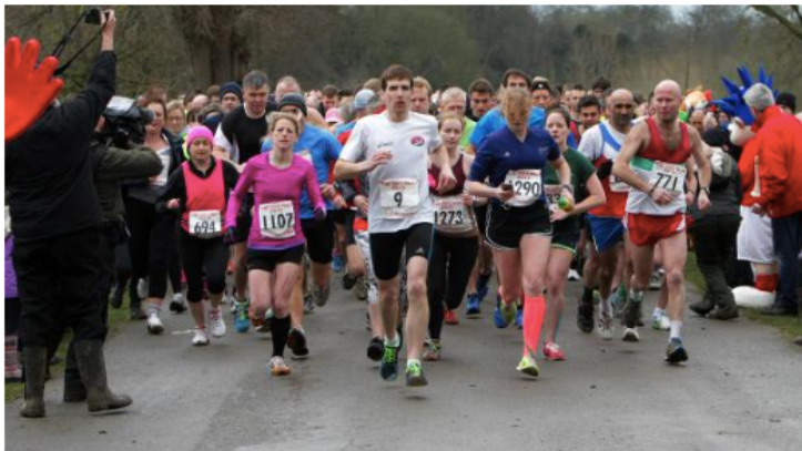
The runners set off on the five-mile course around Blenheim Palace.

First published Monday 30 March 2015 in OX5 Run Last updated 07:07 Monday 30 March 2015